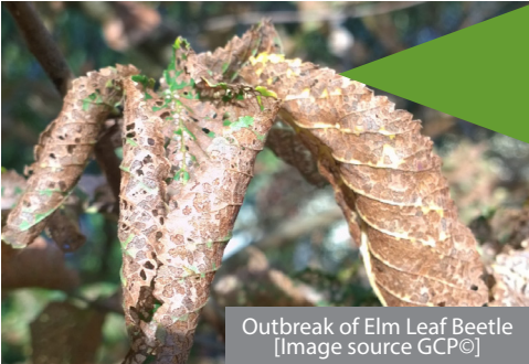
Outbreak of Elm Leaf Beetle