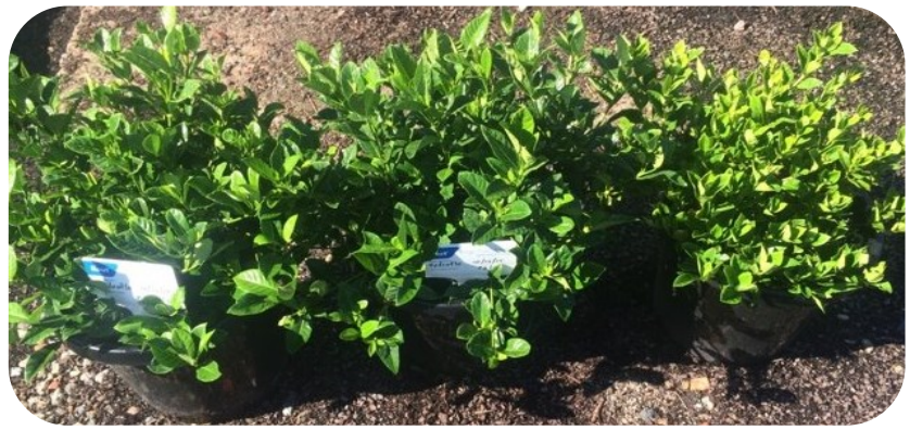
Figure 4. Reapplication of Hydraflo to Gardenia Florida improved leaf size, leaf colour and reduced the time to sale.

Gardenia Florida were topdressed with granular Hydraflo 2 at 0 grams, 1 gram and 2 grams per litre. At 50 days after treatment, plants treated with Hydraflo had larger leaves and improved leaf colour (Figure 4). At 2 g/L, 100% of the treated plants were saleable. At 1 g/L 65% of the treated plants were saleable. When left untreated, only 53% of the plants were saleable.