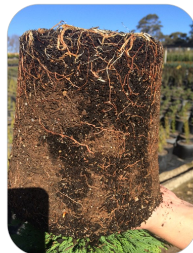
Figure 1. Severe water repellency can result in dry patches and water channelling through the media.

Plants may also suffer from the effects of relatively mild water repellency even before the media shows visual signs of dry patch. In the early stages of development, moisture storage in the growing media will be affected.