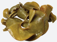
Seasol Liquid Seaweed extract

Seasol Plus Calcium is a Calcium fortified Seasol concentrate. This product has all the benefits of Seasol, with Calcium for improving cell-wall integrity in developing fruit and leaves. Improved fruit firmness and colour at harvest. Better quality retention through packing and cool-storage.