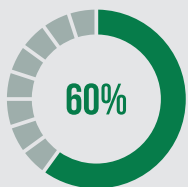
Seasol Liquid Seaweed extract

Trilogy 631 is a unique blend of three refined natural soil & plant beneficial compounds. Seasol (Kelp), PowerFish (Fish extract) and Organic Humate. Trilogy 631 enhances plant and root growth, supplying the soil carbon and nitrogen cycle, supplying plants with amino acids, leaves the soil with Soil Organic Matter, and converting more sunlight.