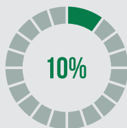
Liquid Humate extract

Each of the extracts have ingredients for specific roles: